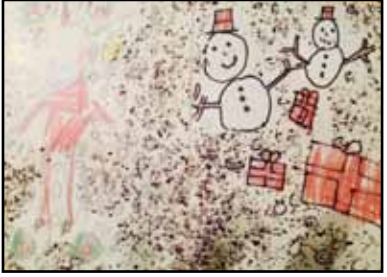
Abbey Clinton - Age 5